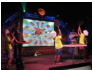
Pizza Flop Game