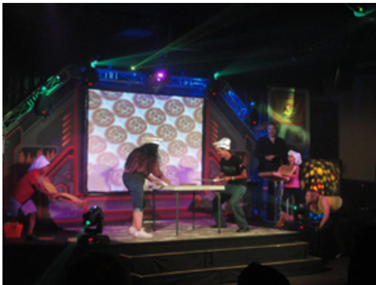
Families playing the Pizza Flop Game During a Jubilee Gang Family Event