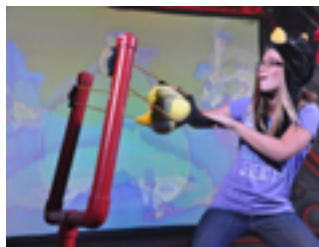
Angry Birds Live Game