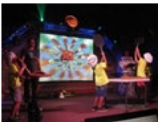
Pizza Flop Game