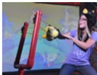
Angry Birds Live Game